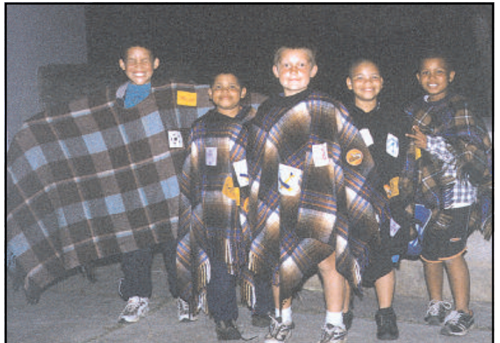
1ST COTSWOLD GUESTS READY FOR THE CAMPFIRE